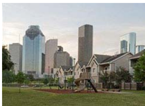
HHA's Historic Oaks of Allen Parkway Property

Congratulations to BBC Multifamily Sector partners Houston Housing Authority (HHA) and San Antonio Housing Authority (SAHA) on achieving 2019 Awards of Merit from the National Association of Housing and Redevelopment Officials (NAHRO) for energy efficiency projects. HHA was honored with an award in Program Innovation for achieving utility savings resulting from an Energy Performance Contract (EPC) with Siemens Industry Incorporated. SAHA was recognized for their energy efficient rehabilitation of their Charles Andrews Apartments and redevelopment of the Wheatley Park Senior Living Development. They were also commended for their innovative Solar Mesh idea and SMARTI.SAHA.ORG Microsite that uses solar energy to access a local network and distribute free Wi-Fi.